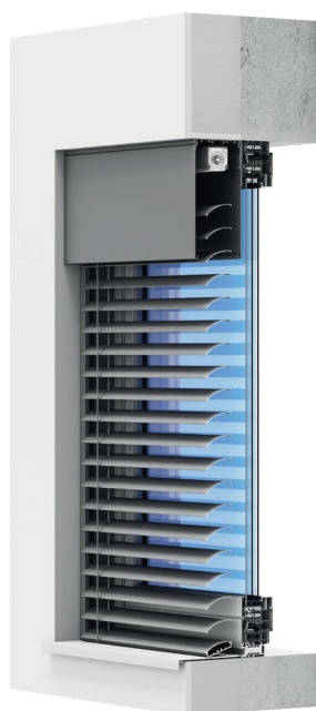
front mounted external venetian blind C80