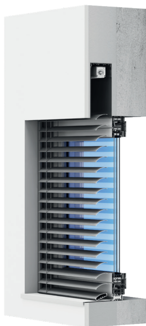
flush mounted external venetian blind C80