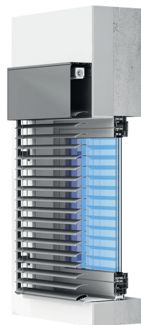
front mounted external venetian blind C80